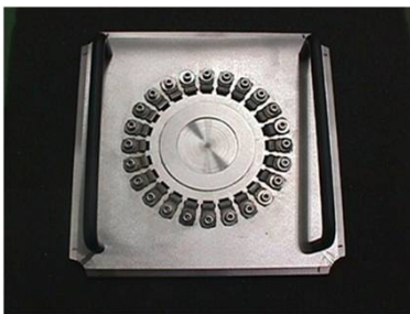
New MT 24-axis Holder

Description: _____ Rubber & Glass Pads Available for various Hardness & Thickness ( ask for details ): 60, 65, 70, 75, 80, 85 & 90 durometer 4.8, 4.9, 5.0, & 5.05 mm thickness All for 5" diameter