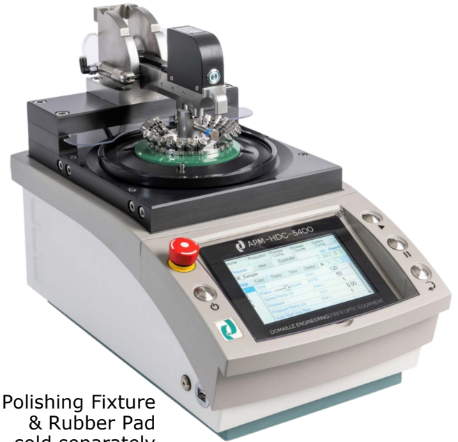
Polishing Fixture & Rubber Pad sold separately

Advancements include increased polishing pressure up to 24lbs, AbraSave+® innovation, integrated Micro-G® controls, bi-directional polishing platen, improved overarm handle and lock mechanism, illuminated arm pushbutton displaying machine status, and a built-in alert horn.